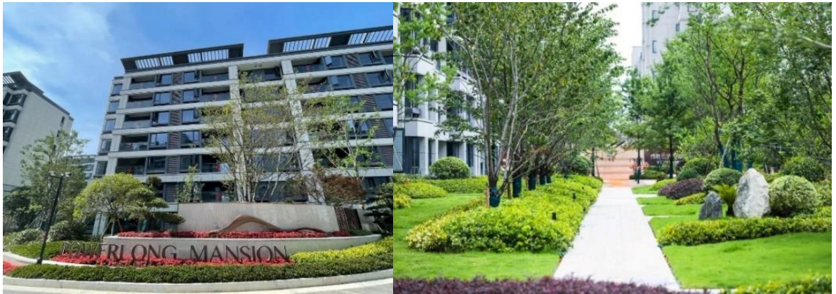
Huzhou Changxing Powerlong Mansion (湖州長興寶龍世家)

In the early planning stage of Huzhou Changxing Powerlong Mansion (湖州長興寶龍世家), the strictest and highest standards were implemented across the board from construction methods, facade materials, construction technology to construction quality, to ensure each building is made with the highest quality. Maintaining Powerlong's consistent artistic background, aesthetics, art, ingenuity and quality were poured into every detail of the buildings with modern architectural aesthetics perfectly presented.