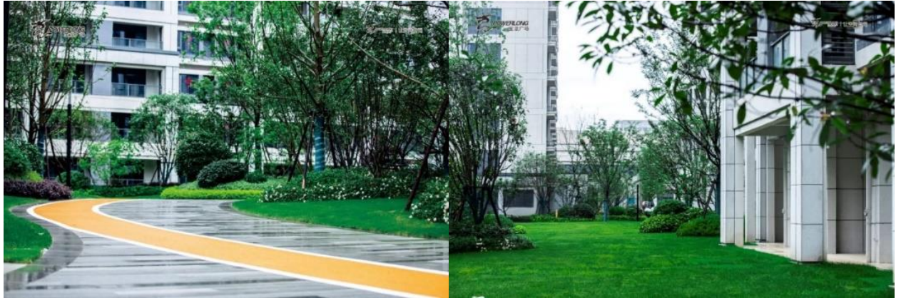
Lanxi Powerlong Mansion (金華蘭溪寶龍世家)

With 800 meters of landscape promenade, 450 meters of an ecological health runway, and green cascade, Jinhua Lanxi Powerlong Mansion (金華蘭溪寶龍世家) is fully immersed in greenery that creates an attractive, delightful garden and an elegant and healthy model for an ideal park residence.