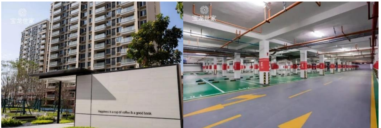
Jinjiang Xintang Powerlong Mansion(晉江新塘寶龍世家)

Powerlong was founded in Fujian, and Jinjiang Xintang Powerlong Mansion(晉江新塘寶龍世家) is another representative work of Powerlong in southern Fujian. With a simple yet elegant colour design and building facades with modern and versatile style, every inch of space, even the underground parking lot, has been meticulously designed to ensure lighting, ventilation and aesthetic innovation, making the basement not just a parking space, but a warm transition between the city and the family.